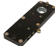
Kwik Torque with Pin (Legacy Prior 11/2007 Advantage Prior 2/2008) Part No. 10113-P $38.00