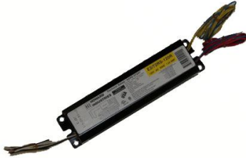
T10/T12 Ballast Part No. 10057 $177.00