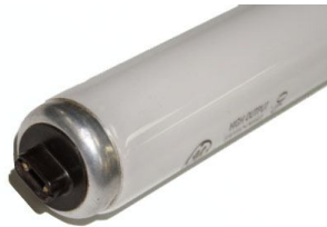
Lamp T12 Part No. 10073-12 $58.00