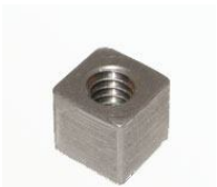
Stud Mounting Block H-O Prior to 2005 Part No. 10032 $3.00 ??