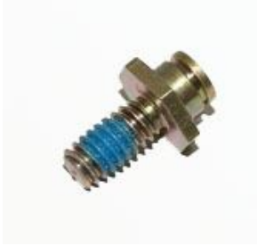
Hold Open Stud Prior to 2005 Part No. 10029 $3.00