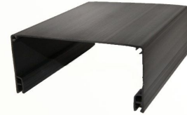
Rear Mullion Cover* Part No. 10012 $19.00p/ft