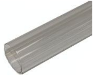
Lamp Shield T8/T12* Part No. 10051 $36.00