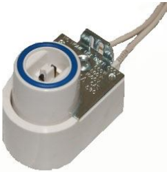
T10/T12 Top Socket Part No. 10049 $32.00