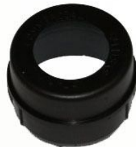
Shield End Cap T8/T12 Part No. 10039 $5.00