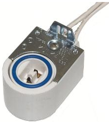
T10/T12 Bottom Socket Part No. 10050 $28.00