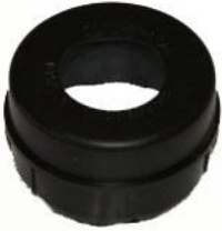
Shield End Cap T10 Part No. 10039-10 $5.00