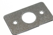
Nutsert Retrofit Plate H-O Part No. 10229 $5.00