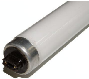
T10 Lamp Part No. 10073-10 $80.00