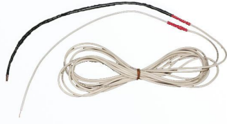
Frame Heater Assy. Part No. 10077F $75.00