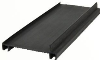
Endless Frame Cover* Part No. 10015 $17.00p/ft