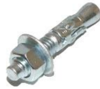
Anchor Bolt 3/8-16X2-1/4 Part No. 10102 $9.00