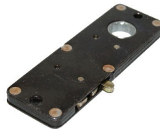
Kwik Torque w/o Pin (Legacy 11/2007 to Present Advantage 2/2008 to Present) Part No. 10113 $38.00