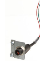
Htr Plug Female Adv End Part No. 10248-E $42.00