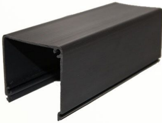
Raceway Cover* Part No. 10013 $12.00p/ft