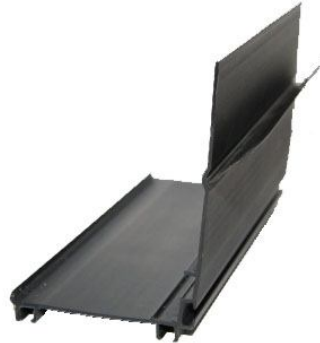
Frame Cover Low Temp* Part No. 10023 $25.00