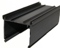
Reflector Advantage End* Part No. 10138 $19.00p/ft