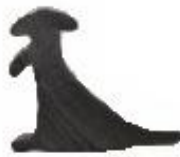
Plate Holder Part No. 10017 $6.00p/ft