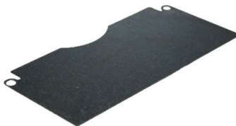
End Cap Center Flat Part No. 10035-F $6.00