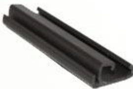
Plate Retainer* Part No. 10016 $6.00p/ft