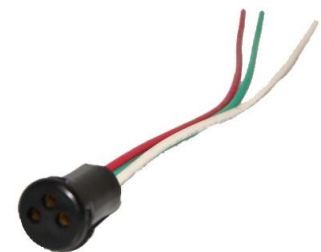
Heater Plug Female Part No. 10054 $36.00