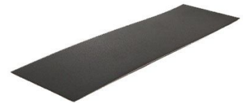
Contact Plate Part No. 10041 $12.00p/ft