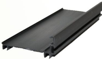
Econo Cover* Part No. 10014 $17.00p/ft