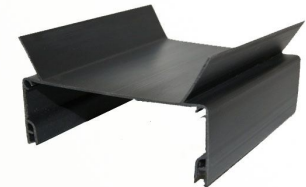
Rear Mullion Cover LED* Part No. 10324 $25.00p/ft