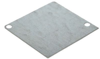
End Cap End Part No. 10036 $6.00