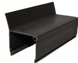
End Cover LED* Part No. 10325 $19.00p/ft