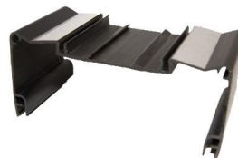
Rear Mull Cvr Advantage* Part No. 10137 $25.00p/ft