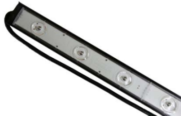
I LED Center

Part No. 10363-24 $334.00 Part No. 10363-60 $395.00 Part No. 10363-72 $474.00