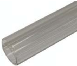
Lamp Shield T8/T12* Part No. 10051 $37.00