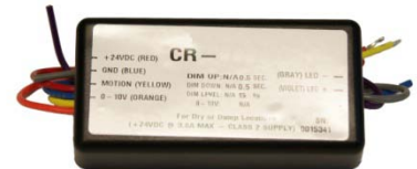
DC Converter Part No. 10365-0900 $99.00 Part No. 10365-1800 $99.00 Part No. 10365-2400 $99.00 Part No. 10365-2700 $99.00 Part No. 10365-3000 $99.00 Part No. 10365-3600 $99.00