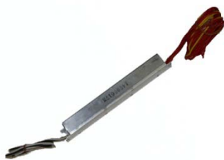
T8 Ballast 58W Part No. 10179 $178.00