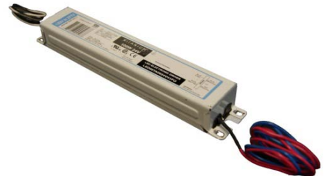
100W Driver Part No. 10364-100 $256.00