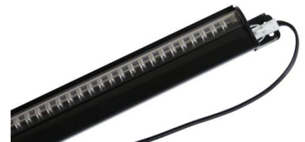
Q LED Right End

Part No. 10460-48 $Call Part No. 10460-60 $300.00 Part No. 10460-72 $410.00