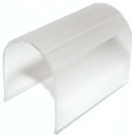
Lamp Shield Adv.* Part No. 10136 $37.00