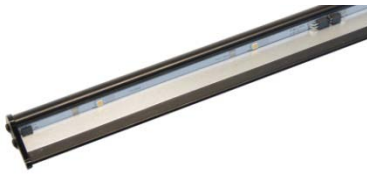
LED Left End

Part No. 10362-24 $334.00 Part No. 10362-60 $395.00 Part No. 10362-72 $474.00