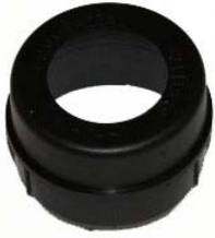
Shield End Cap T8/T12 Part No. 10039 $6.00