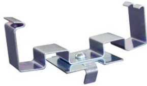
Q LED Center Clip Part No. 10440 $7.00