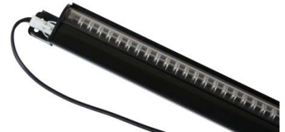
Q LED Left End

Part No. 10422-48 $330.00 Part No. 10423-60 $460.00 Part No. 10426-72 $550.00