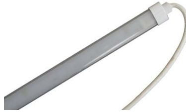
I LED Left End

Part No. 10361-24 $665.00 Part No. 10361-60 $682.00 Part No. 10361-72 $788.00