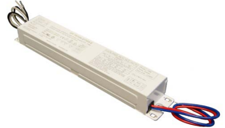
75W Driver Part No. 10364-75 $225.00