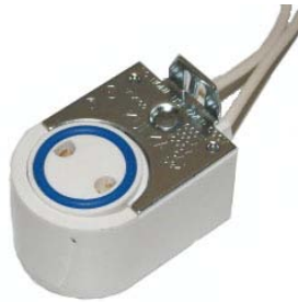
T8 Bottom Socket Part No. 10183 $29.00