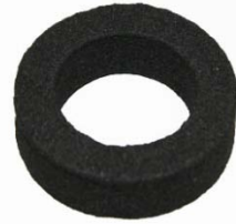
Neoprene Lamp Spacer Part No. 10200 $4.00