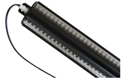
Q LED Center

Part No. 10421-48 $300.00 Part No. 10421-60 $300.00 Part No. 10425-72 $410.00