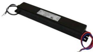
I LED 60W Driver

Part No. 10459-48 $Call Part No. 10459-60 $300.00 Part No. 10459-72 $410.00