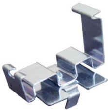
Q LED End Clip Part No. 10441 $7.00