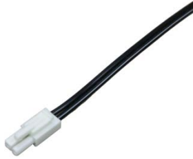
Q LED Power Cord Part No. 10461 $7.00