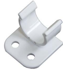
I LED End Clip

Part No. 10420-48 $300.00 Part No. 10420-60 $300.00 Part No. 10424-72 $410.00