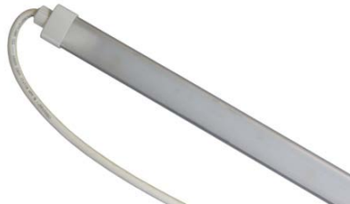
I LED Right End

Part No. 10362-24 $334.00 Part No. 10362-60 $395.00 Part No. 10362-72 $474.00