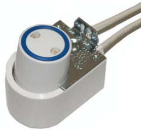
T8 Top Socket Part No. 10182 $33.00