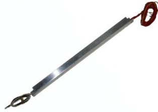
T8 Ballast 70W Part No. 10180 $192.00