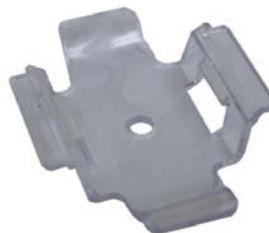
I LED Center Clip