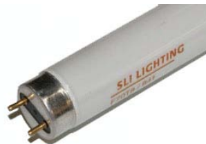
T8 Lamp 24", 60" & 72" Part No. 10199-24 $47.00 Part No. 10199-60 $44.00 Part No. 10199-72 $34.00