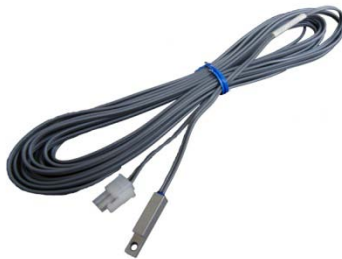
Temperature Sensor Part No. 10455 $95.00