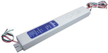
Heater Controller Part No. 10369 $950.00