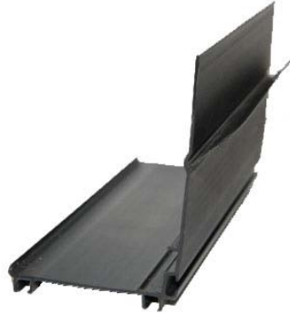
Frame Cover Low Temp* Part No. 10023 $26.00