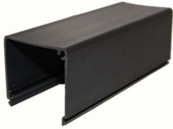
Raceway Cover* Part No. 10013 $13.00p/ft