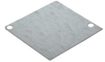
End Cap End Part No. 10036 $7.00