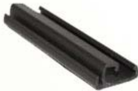
Plate Retainer* Part No. 10016 $7.00p/ft