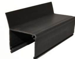
End Cover LED* Part No. 10325 $19.50p/ft