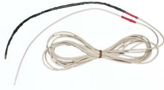
Frame Heater Assy. Part No. 10077F $78.00