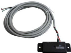
Humidity Sensor Part No. 10454 $275.00