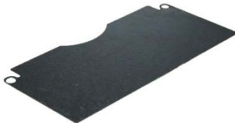
End Cap Center Flat Part No. 10035-F $7.00