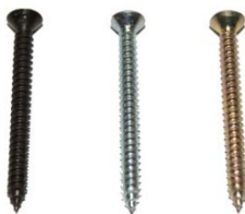
Installation Screw Part No. 10099 $4.00