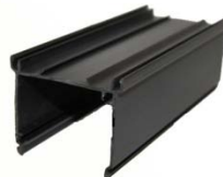
Reflector Advantage End* Part No. 10138 $20.00p/ft