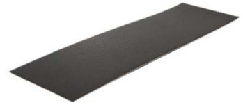
Contact Plate Part No. 10041 $13.00p/ft