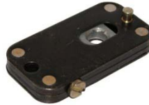
Kwik Level Part No. 10112 $36.00