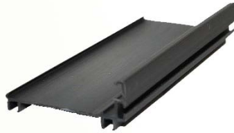
Econo Cover* Part No. 10014 $18.00p/ft