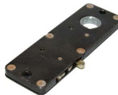
Kwik Torque w/o Pin (Legacy 11/2007 to Present Advantage 2/2008 to Present) Part No. 10113 $39.00