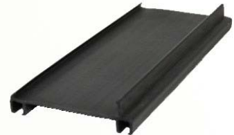
Endless Frame Cover* Part No. 10015 $18.00p/ft