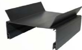
Rear Mullion Cover LED* Part No. 10324 $26.00p/ft