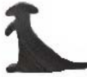
Plate Holder Part No. 10017 $7.00p/ft